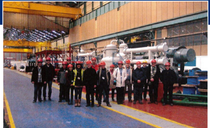
In December 2017 a group of members enjoyed a visit to Howdens site at Inchinnan, Paisley

This visit will allow members a guided tour around the state of the art facilities at this site.